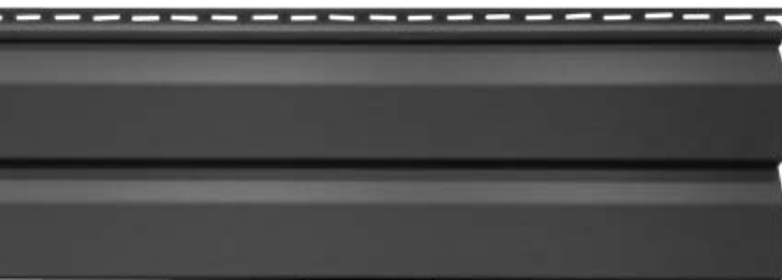
Double 4.5" Dutchlap Siding in Manor

If there's one thing that made Rockwell's work so masterful, it was his attention to detail. The same can be said for the exteriors he inspired.