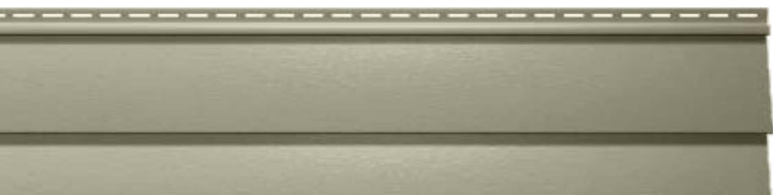
Double 4" Clap Board Siding in Khaki

Low-gloss cedar texture taken from actual wood panels for a truly authentic appearance.