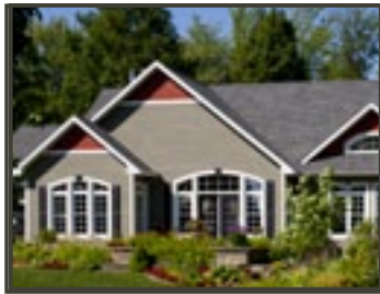
TrimFX® Decorative Vinyl Trims

We work hard to ensure customer satisfaction with a limited lifetime warranty. Read our full warranty for details. They are available from any KP distributor or on our website at www.KPvinylsiding.com