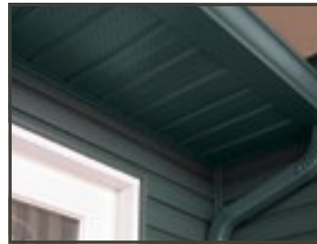
Aluminium Trims & Accessories