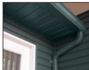
Aluminium Trims & Accessories