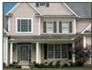
TrimFX® Decorative Vinyl Trims

Read our full warranty for details. They are available from any KP distributor or on our website at www.KPproducts.com