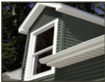
TrimFX® Decorative Vinyl Trims

We work hard to ensure customer satisfaction with a limited lifetime warranty. Read our full warranty for details. They are available from any KP distributor or on our website at www.KPvinylsiding.com