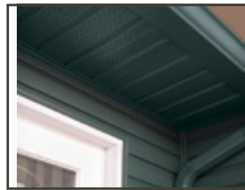
Aluminium Trims & Accessories